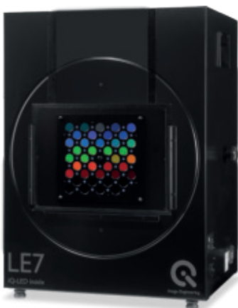
LE7 with the TE292 XL chart

The TE292* has been adapted from the front plate of the camSPECS device. This chart has been developed to be used primarily with the LE7 for camera calibration with iQ-LED illumination.