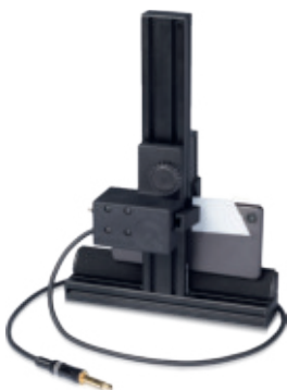
iQ-Defocus with iQ-Mobilemount

The iQ-Defocus is primarily used in conjunction with the LED-Panel. Easily attach the device to the iQ-Mobilemount and control via integrated software in the LED-Panel.